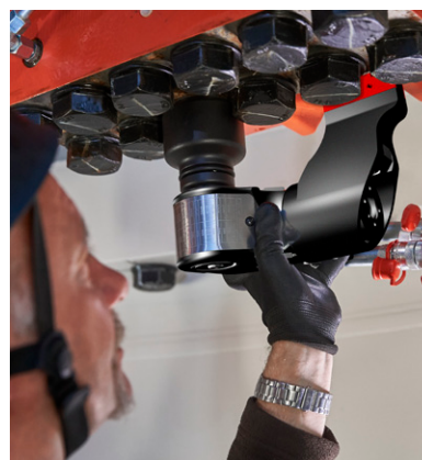
alkitronic® H-AT Use in a wind power plant