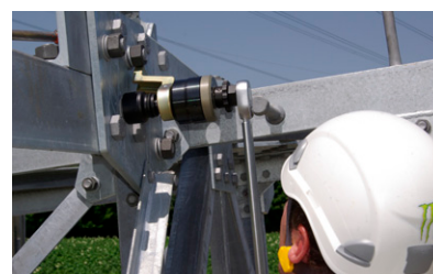
alkitronic® M-HG operating on electricity pylons. Accurate tightening via torque wrench.